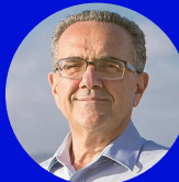
SD City Councilmember Joe LaCava