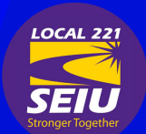
SEIU Local 221