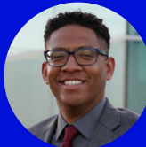
National City Councilmember Marcus Bush