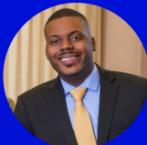
Special Adviser to Gov. Newsom Michael Tubbs