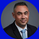
SD City Councilmember Sean Elo-Rivera