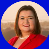
SD City Councilmember Vivian Moreno