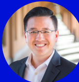
SD City Councilmember Kent Lee